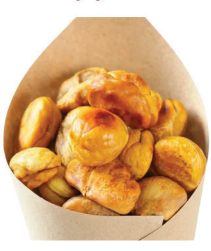
Lastly, our chestnuts are delivered to you and over 1,800 other happy customers across 46 states and counting. No matter how you enjoy them, our chestnuts are guaranteed to satisfy!