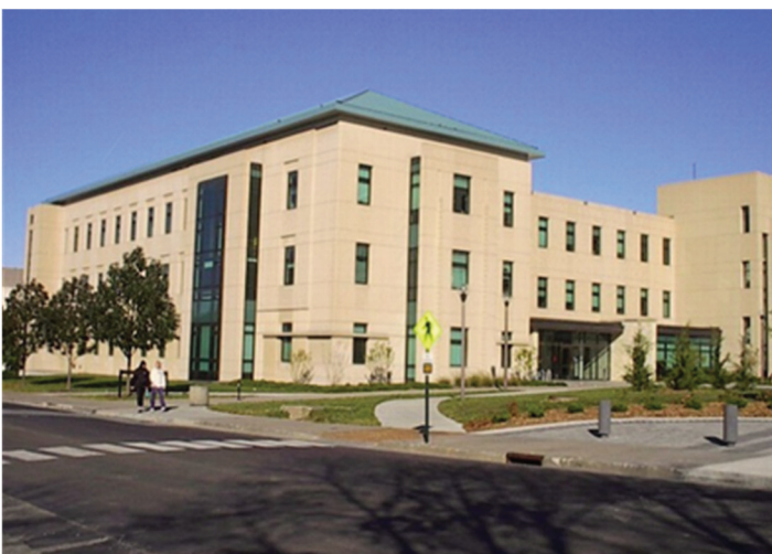
Anheuser Busch Natural Resources Building