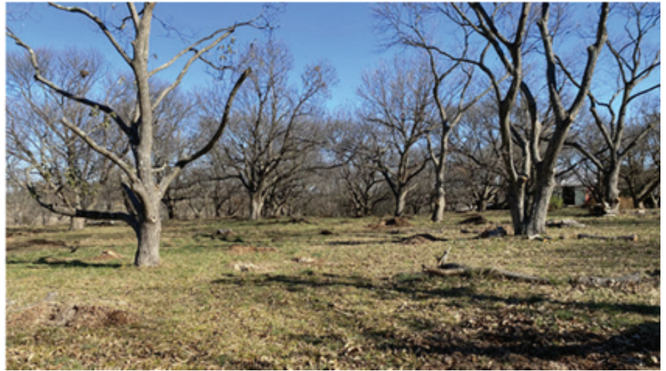
Figure 4. With funding from a SARE grant, we are experimenting with different pruning and fertilization options in this 60-year-old chestnut orchard.

We are invested in furthering the body of knowledge of nut culture through research in planting, maintaining, processing, and marketing chestnuts.