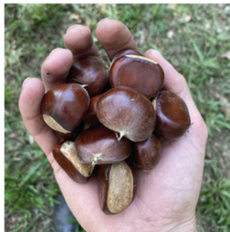
Figure 5. Chestnuts from the SilvoCulture orchard.