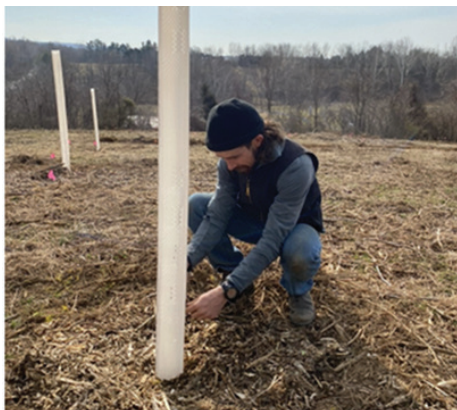
Figure 3. Orchard establishment of chestnut seedling with Plantra tree tubes for protection from rabbits and deer.

Since our inception we have established multiple small orchards in the region (Figure 3). These orchards will provide long-term food security for the surrounding community for generations. We expect them to begin bearing within the next few years, providing us with fruits and nuts to bring to our local markets and customers.