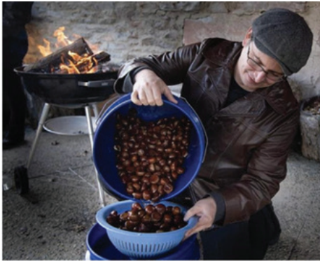
Figure 2. Volunteer preparing chestnuts for roasting at our 2nd Annual Chestnut Roast.

We also roasted nuts in downtown Frederick, Maryland during the holiday season. The roasted nuts were met with great enthusiasm by those passing by and introduced many to the work SilvoCulture is doing.